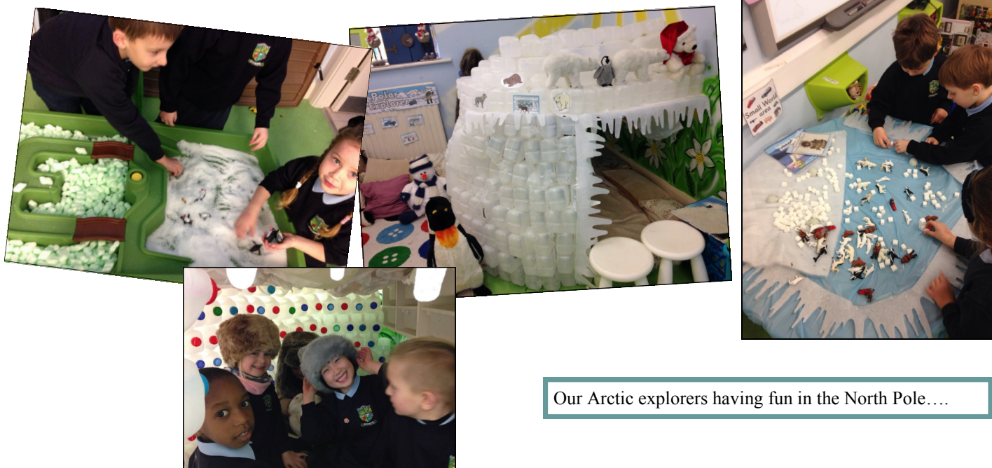
Our Arctic explorers having fun in the North Pole....