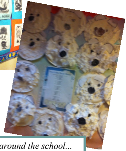
Arctic art from around the school...