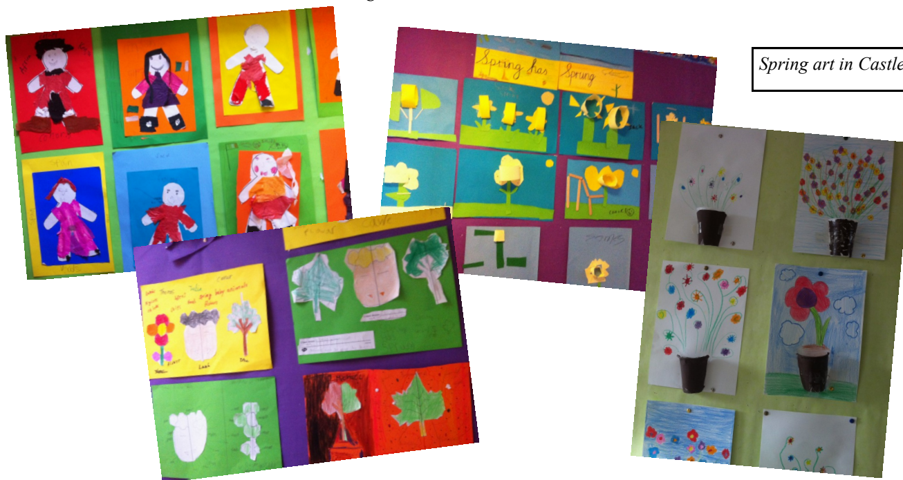
Spring art in Castlegar NS...